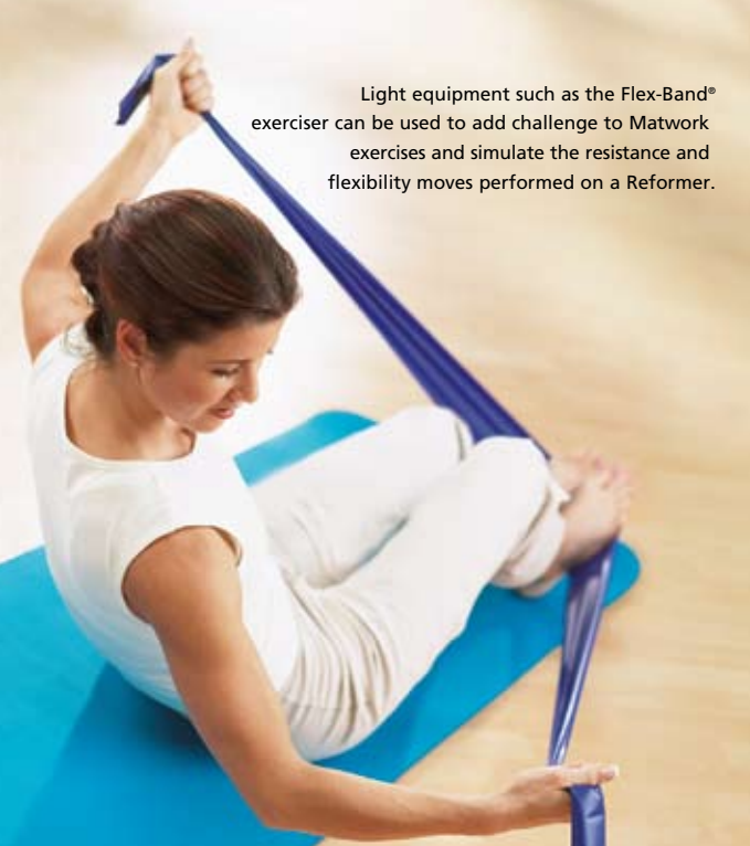
Light equipment such as the Flex-Band® exerciser can be used to add challenge to Matwork exercises and simulate the resistance and flexibility moves performed on a Reformer.